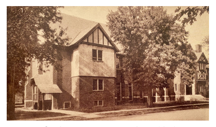
The Community House Circa 1940