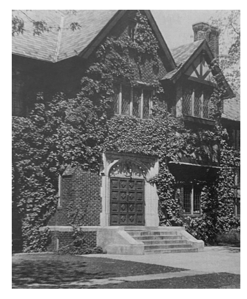
The Community House Circa 1960