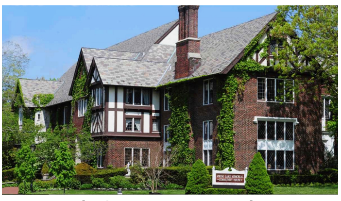
The Community House Today