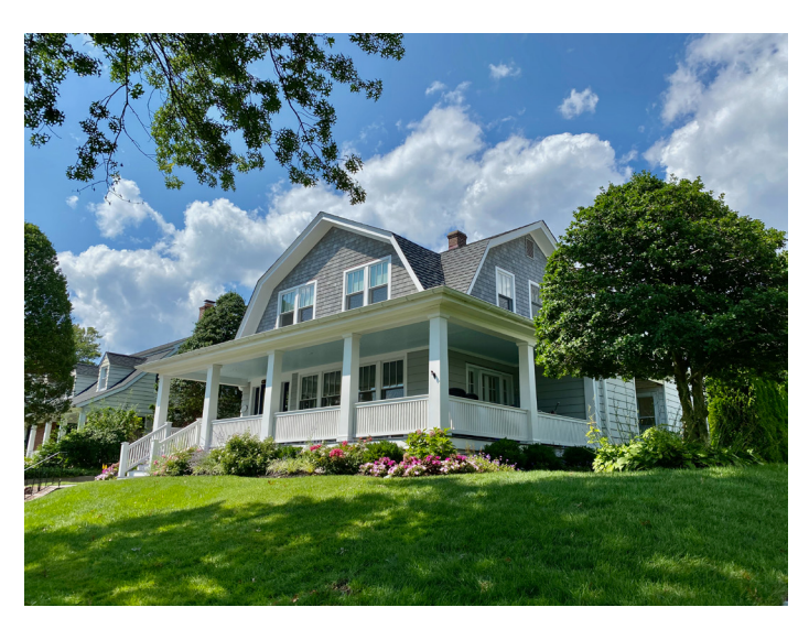
Two of this year's House Tour Homes